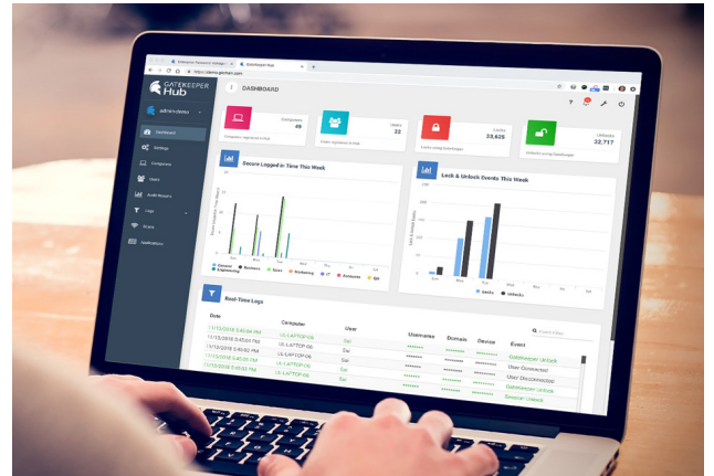
Enterprise Hub provides an easy way to administer security policies for all computers and users on the network, while detailed access logs verify authenticity of users logging onto a company's network locally or remotely.

Each user is provided with a GateKeeper Halberd or Smart Badge. Plus with the Trident App, users can use their smart phone as a wireless key. Wireless keys (tokens) are registered for each person on the server and serve as a unique identifier for that individual. The tokens will be detected and used for authentication when the individual logs into their computer and websites.